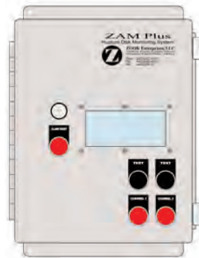
ZAM2 2 Channel Monitor

The ZOOK ZAM alarm system is capable of detecting a ruptured disk condition in applications involving highly electrically conductive fluids. Contact ZOOK for more information regarding this type of application.