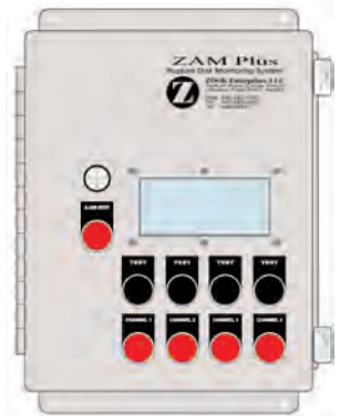
ZAM4 4 Channel Monitor