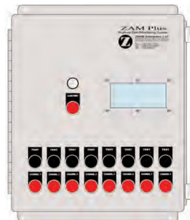
ZAM8 8 Channel Monitor